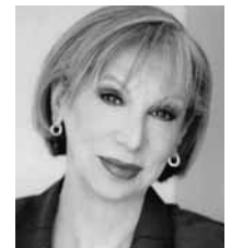
Dr. Joy Browne